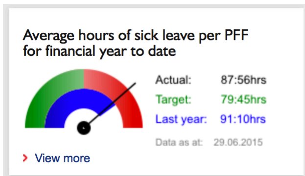
The intranet's sick leave gauge on 29 June ....

Screenshots of the Department's intranet sick leave pressure gauges on 29 June showed the average sick leave taken by permanent firefighters for the 2014/15 financial year to date was 87.56 hours per firefighter – a smidgin over the annual target of 87 hours with just one day left to go. Fast forward two days to 1 July and the figure showing for 2014/15 was 94.48 hours – an explosion of 7 additional hours per permanent firefighter in less than 48 hours?! The previous year was equally hard to fathom.