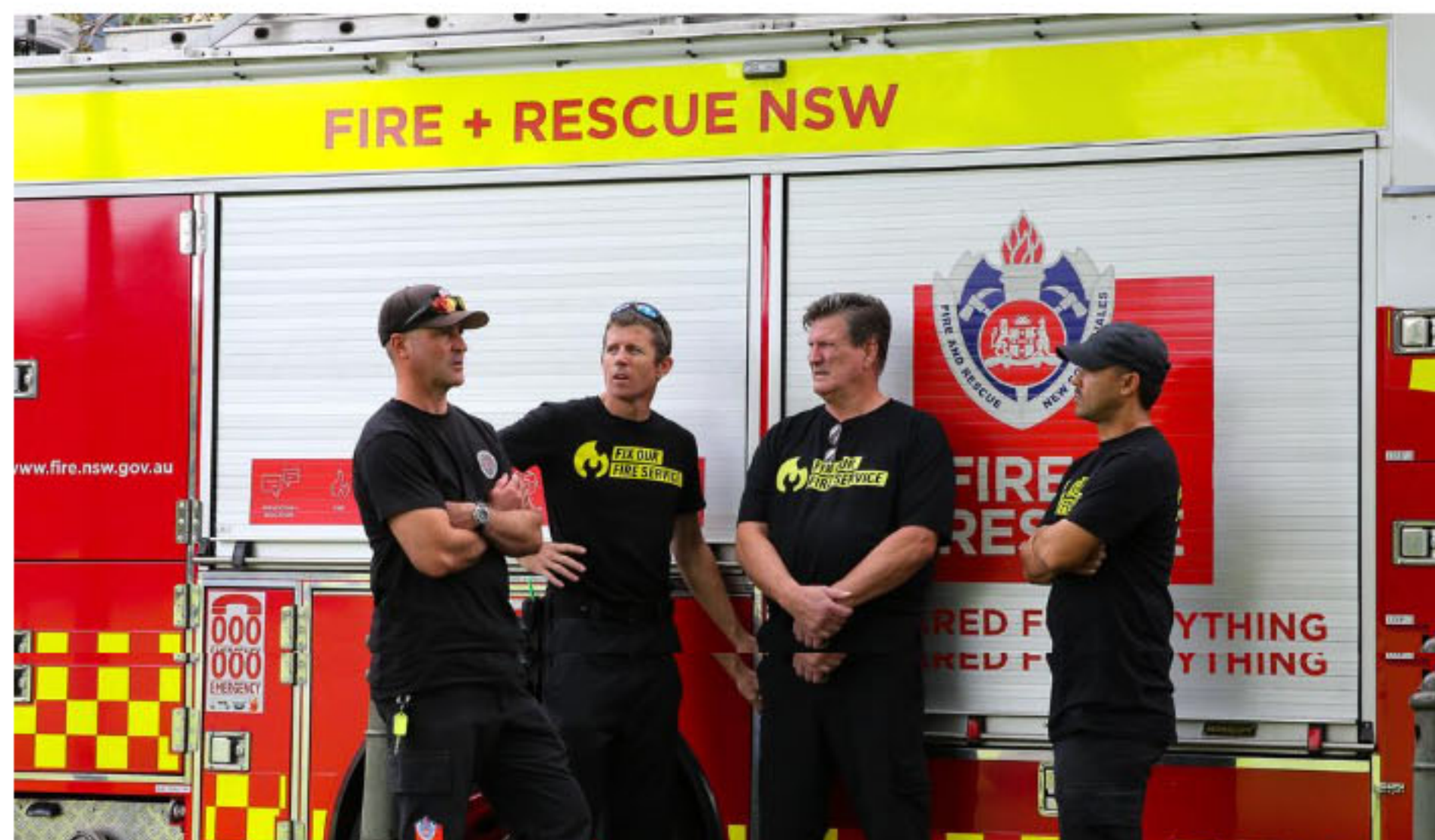
Frustrated Firies gather at Parliament House in Sydney after Minns Govt fails to start negotiations.