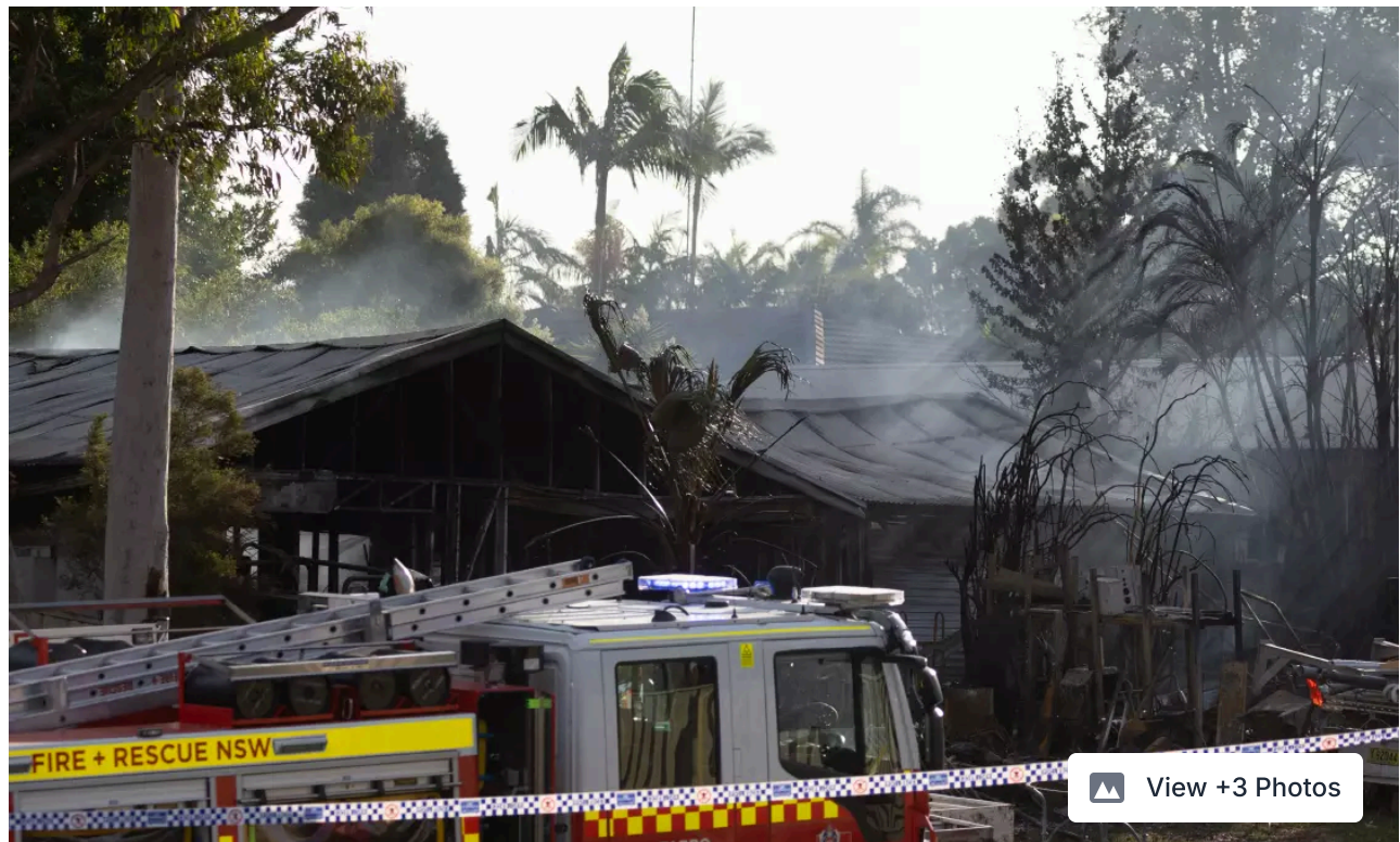
Medowie house fire tragedy

The NSW firefighters union has claimed a man who died in a house fire at Medowie on Australia Day may have been able to be saved if a fully resourced fire station was based in the town.